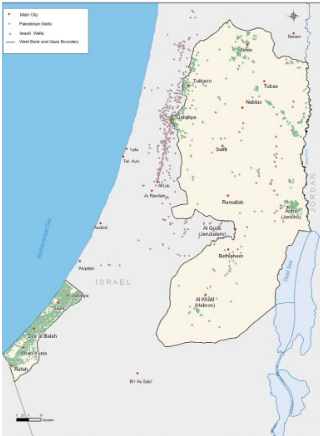
Figure 2. The distribution of groundwater wells in mandate Palestine